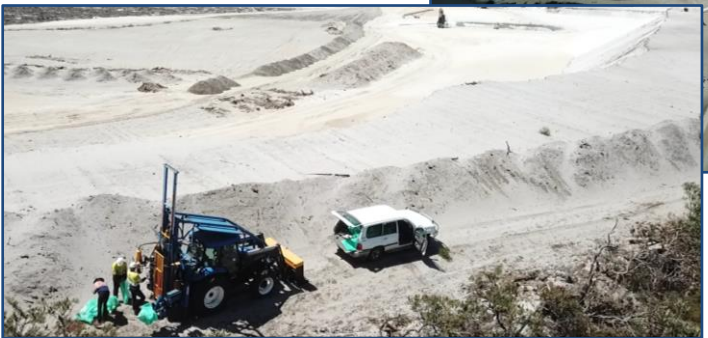
Urban's existing Marella Road Bullsbrook Sand Operation