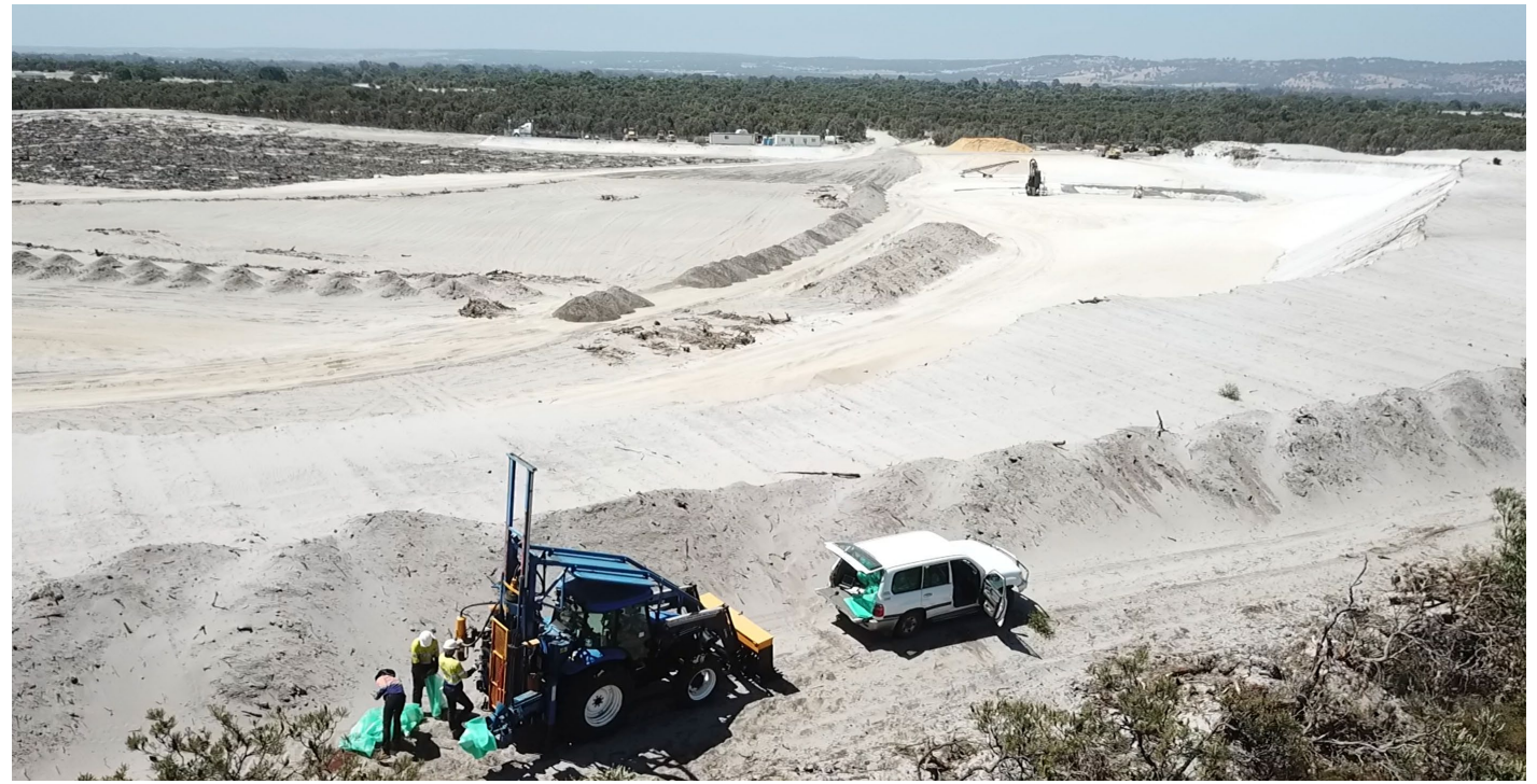
Figure 3: BRL vacuum drilling at Urban's Maralla Road Silica Sand Deposit next to Urban's existing operation