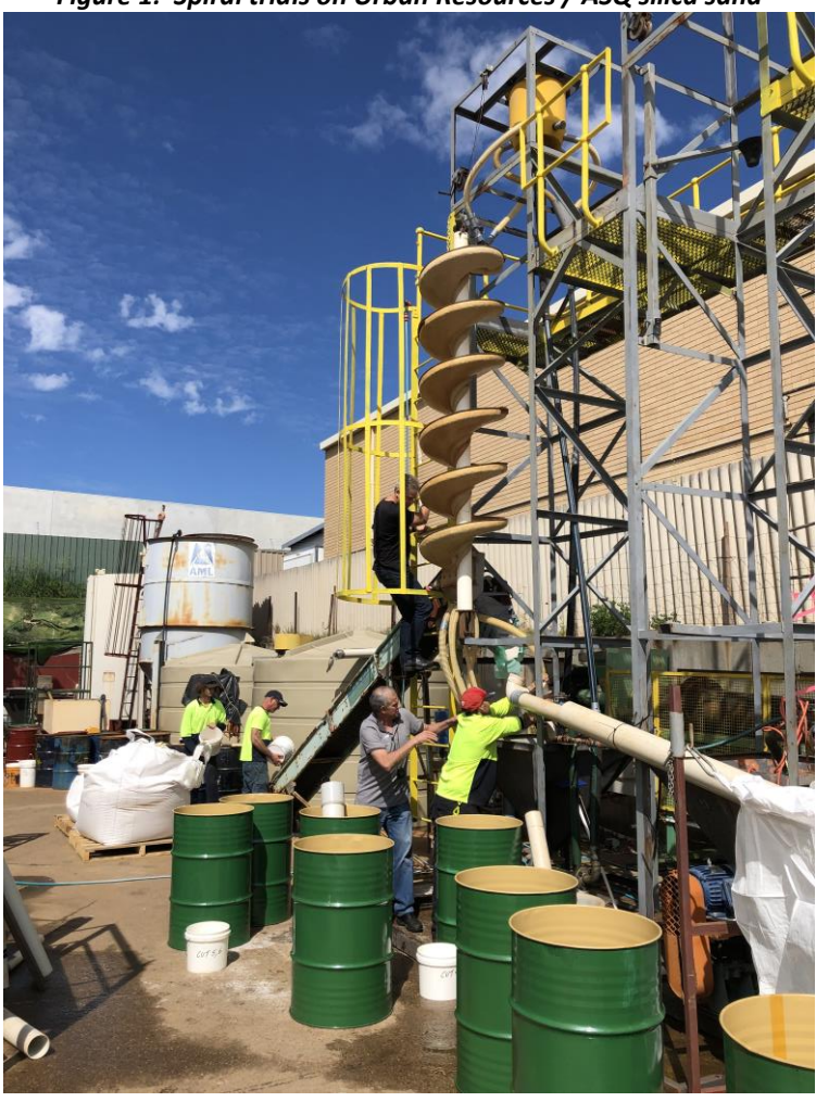
Figure 1: Spiral trials on Urban Resources / ASQ silica sand